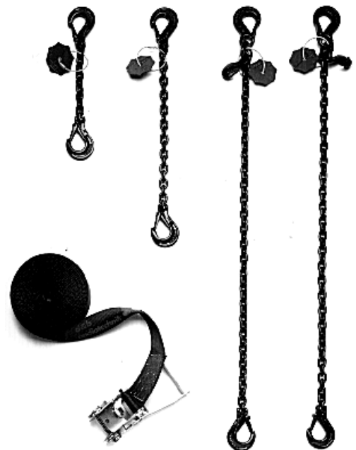
Chains, 2 Hooks (E652X) and 5t Ratchet strap (E6510)