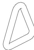
Delta link (E6511)